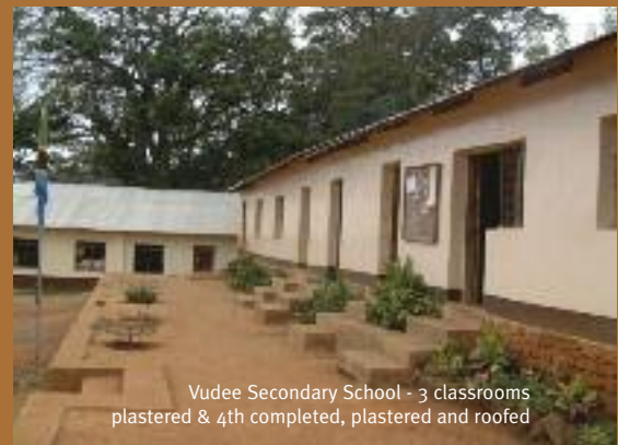
Vudee Secondary School - 3 classrooms plastered & 4th completed, plastered and roofed