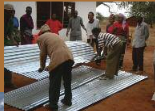
Elisaria donating roofing sheets and building materials to Lunguza Secondary School, Kivingo Village.

We are in the process of determining dates for the official handover of building materials to a further four secondary schools.