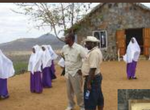
Pupils outside the Environmental Education Centre

The bus itself is a fantastic sight. Painted in tingatinga style, it is a large and dramatic education tool in itself. All the Tanzanians who visit our project think it is really wonderful - we wish we had recorded all of their comments. The actual classroom is built high on a hill in the Rhino Sanctuary with breath-taking views. TUSK, SRI and Chester Zoo all funded construction of this classroom and it is now furnished with benches, desks, education materials, solar power, a generator and a big TV. It also has an outside eating area for the pupils and pit latrines. SRI have donated educational materials and prizes for the school pupils and Chester Zoo are producing more teaching resources and posters.