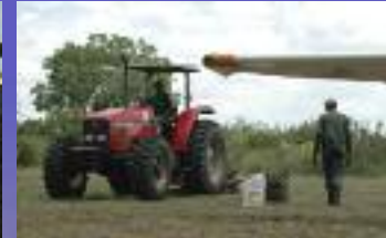
EAZA / Save the Rhino Massey Ferguson tractor being resupplied in the field