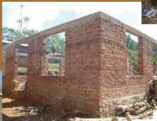
Shighatini Secondary School - ongoing construction to complete one classroom and finish a second