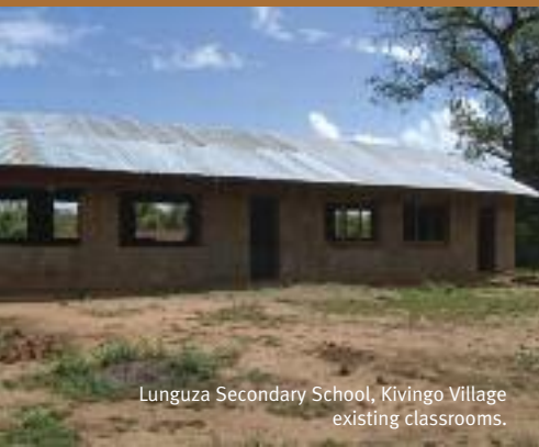
Lunguza Secondary School, Kivingo Village existing classrooms.