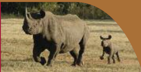
Rose with her second calf – a female – born in February 2009

Our sincerest thanks, as always, go to our Chairmen, Trustees and administrators who have continued to give freely of their time to this undertaking; and to the supporters whose generosity has kept it all going. They should all take much of the credit for the success of this project, but there is still more to do.