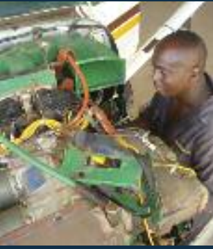
Taking the piston out of the aircraft