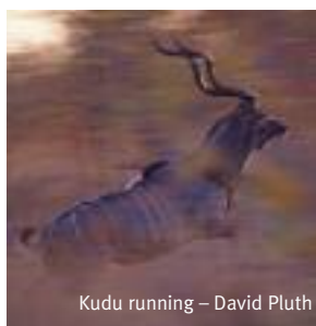
Kudu running