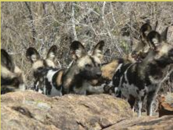
Wild dogs watching