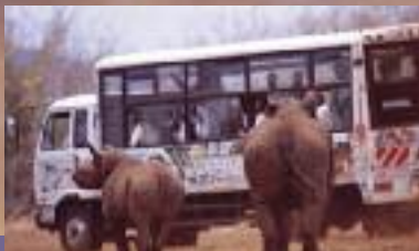
Environmental Education bus 'Rafiki wa Faru' with pupils on board looking at rhinos – David Pluth