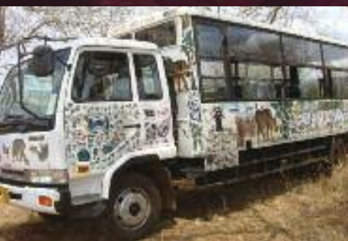
Environmental Education bus

We have now launched the Environmental Education programme, supported by TUSK, Chester Zoo, Save the Rhino and recently WSPA. This is an extraordinary partnership of four conservation organisations and we are extremely proud of the programme we have been able to put together with their funds and advice.