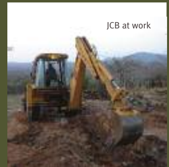
JCB at work