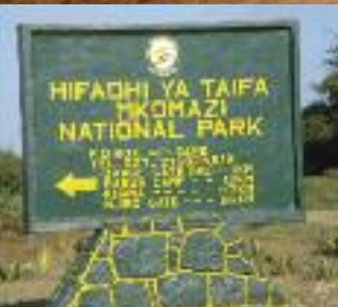
From left: Mkomazi National Park – new sign board. Sunbird. Giraffe. Nina's male calf with the adult bull elephant.