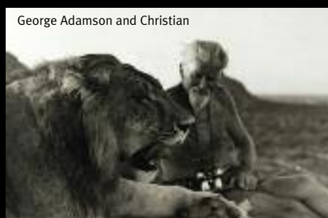
George Adamson and Christian