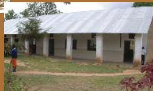
Malindi Suji Secondary School refurbishment.