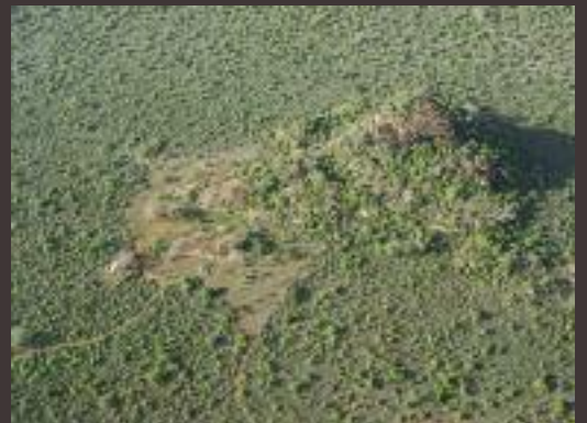
Reintroduction area on the Mkomazi / Tsavo border