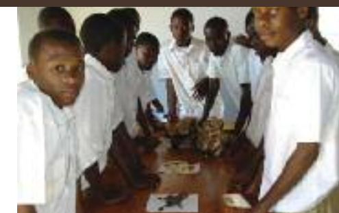
Environmental education pupils categorising