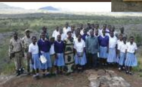
Group of school pupils after a day in the Mkomazi Rhino Sanctuary