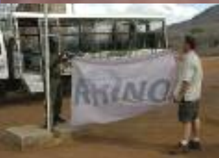
Suzuki Rhino Club raise the flag