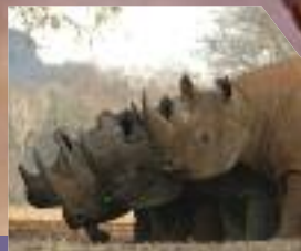
A 'crash' of rhino drinking

Suzuki Rhino Club generously donated 3 new vehicles (2 specifically converted off-road Grand Vitaras and a Jimny) which will greatly relieve the burden on maintaining the old vehicles. The workshop personnel can keep a vehicle going for about 15 years but after that, even they have to admit defeat, especially with the workload and the condition of the roads and the bush.