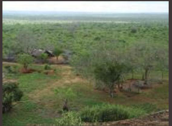
Wild dog reintroduction compound