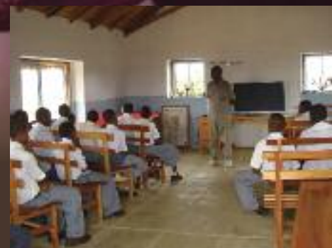
Elisaria teaching pupils in the Environmental Education centre

This programme was developed for the benefit of the local communities, especially local school pupils, as through this initiative they will be actively involved in local environmental issues and wildlife, significantly the conservation of the black rhino and wild dog. Rafiki wa Faru means Friends of Rhino and hopefully some of these children will take up the baton as the next generation of Tanzanians to conserve endangered species.