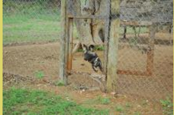
On the way to freedom

As we move through 2009, we have four breeding groups at Kisima and we have been really pleased to show the Chairman, Trustees and Directors of TANAPA the workings of this endangered species programme.