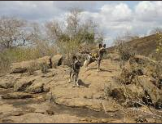
Reintroduced wild dogs

We have had losses to a leopard shortly after release (we had underestimated the return of leopard to Mkomazi) and in December 07 during an unprecedented incursion of nearly 10,000 head of cattle into Mkomazi during the hand-over between the WD and TANAPA, one pack went after the goats owned by pastoralists and were killed. This is obviously horrendous for us but we have to learn from