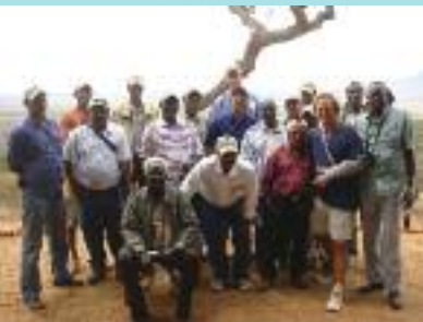
Ethiopian and Sudanese wildlife authorities visit Mkomazi