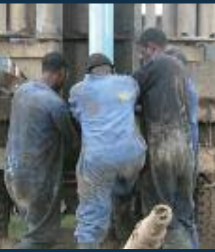
Drilling for water