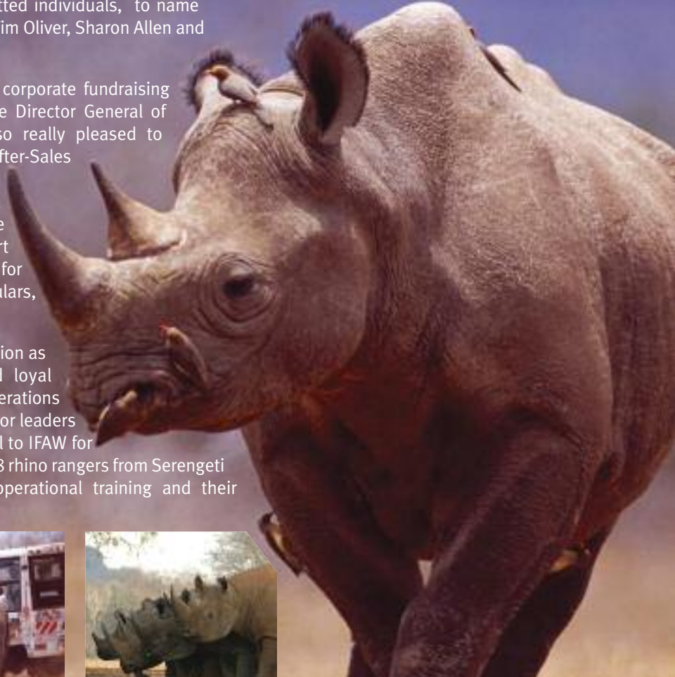
Rhino with oxpeckers