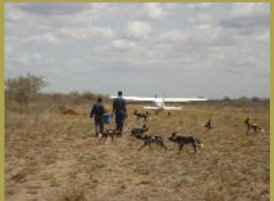
Wild dog airstrip feed.