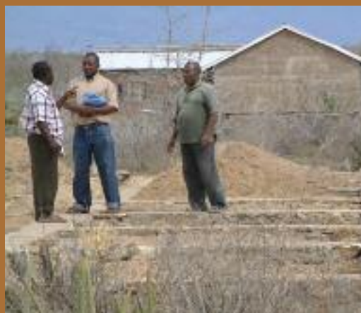
Mapanda Secondary School dormitory foundations