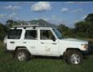
Toyota Landcruiser, donated by IFAW